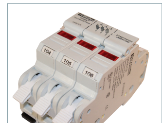
WMB Marker System